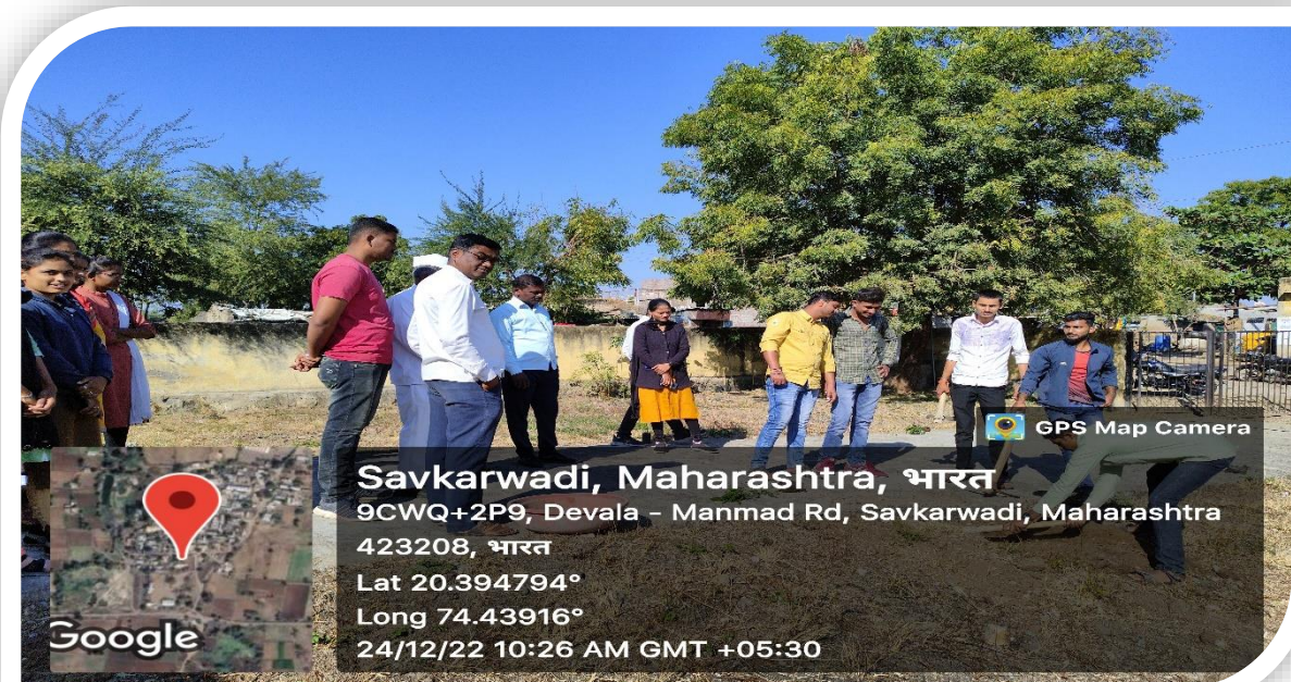
Social Work during N.S.S Camp at Savkarwadi.