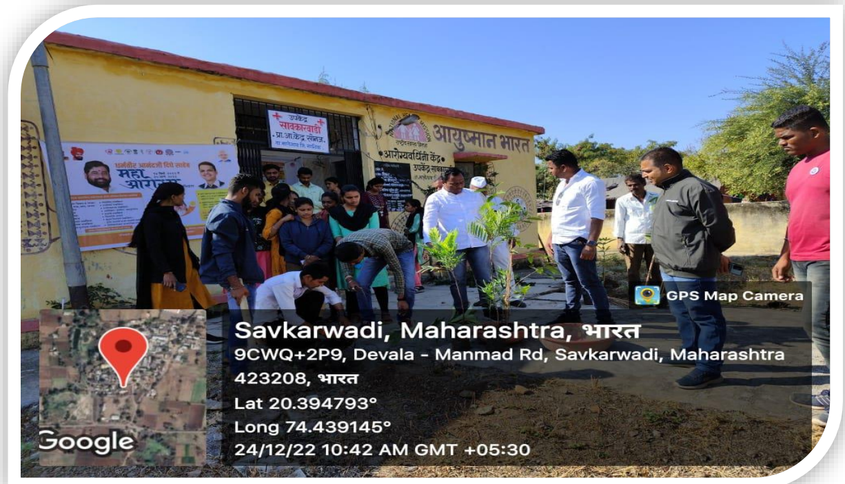
Tree Plantation during N.S.S. Camp at Savkarwadi by Students.