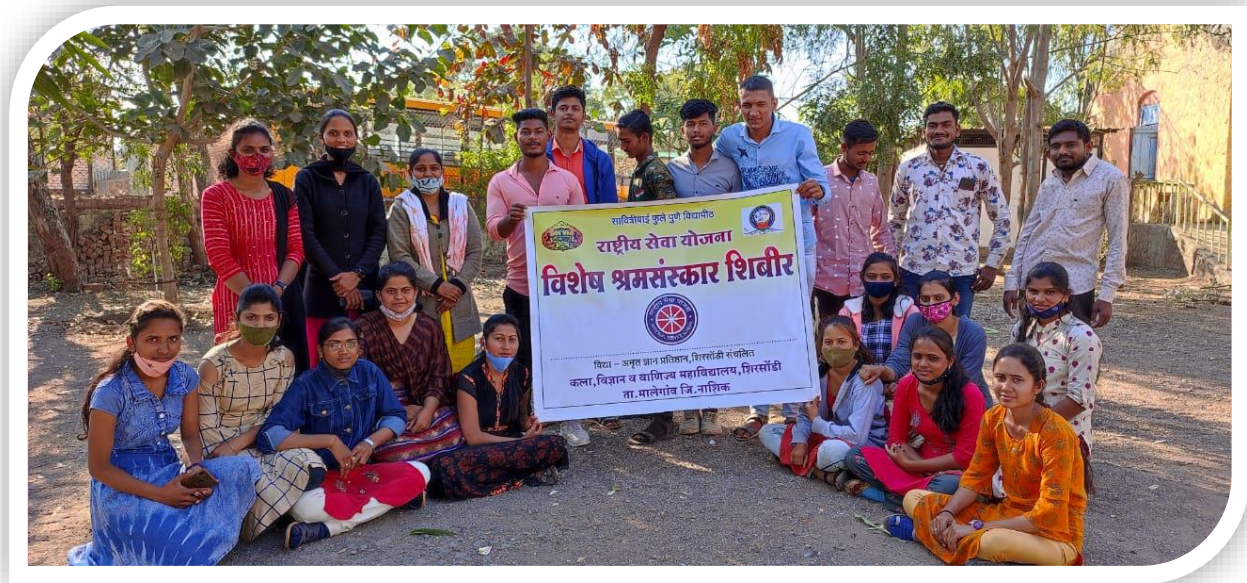
Organize N.S.S. camp at Takali.