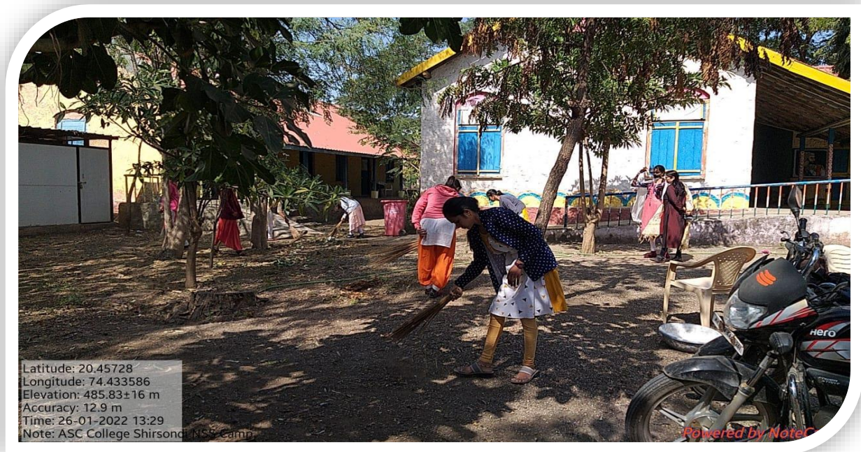
Cleaning of School campus by N.S.S. Students at Takali.