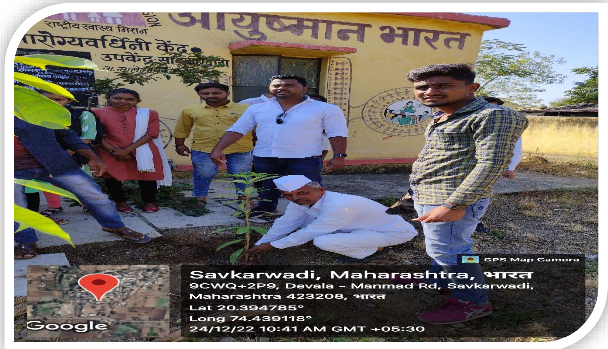
Tree Plantation during N.S.S. Camp at Savkarwadi.