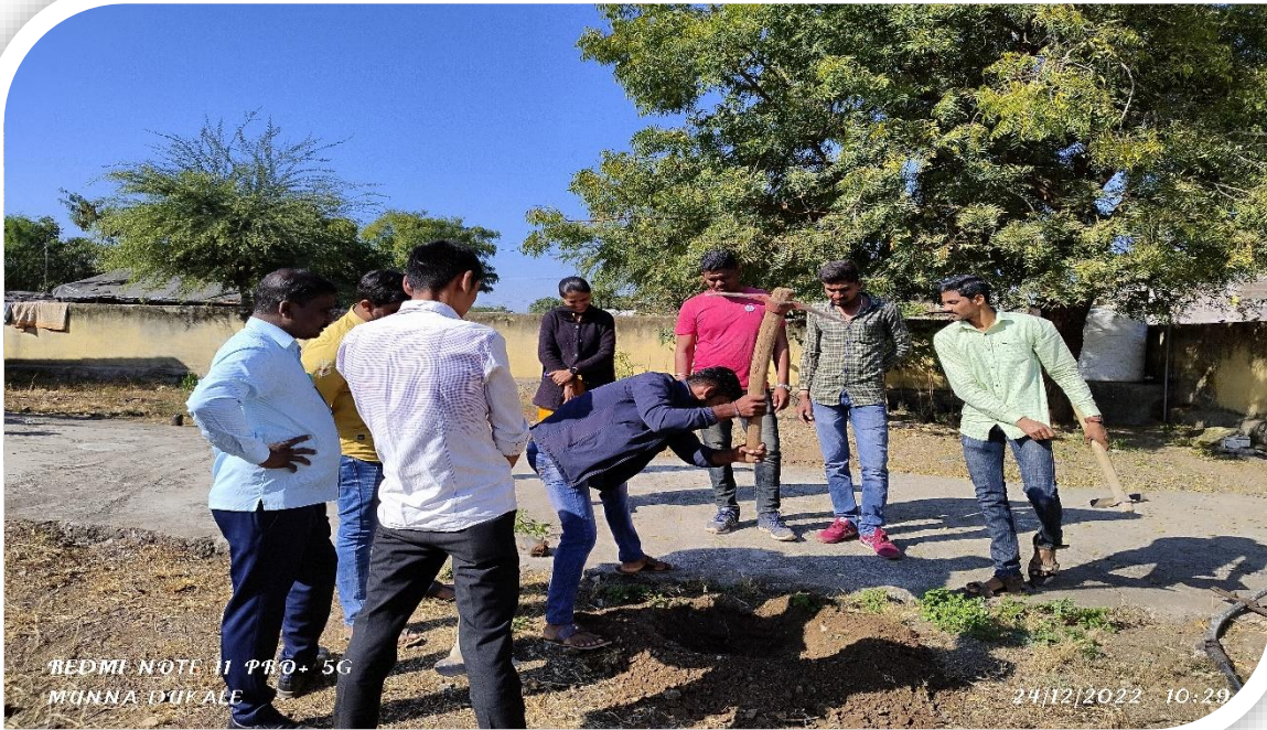
Winter camp of National Service Scheme was organized at Savkarwadi where trees were planted....