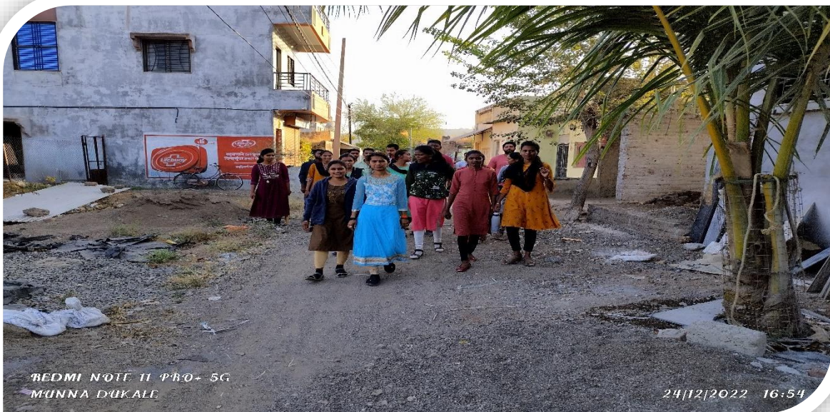
Pollution Free Awareness rally at Savkarvadi village by N.S.S. Students