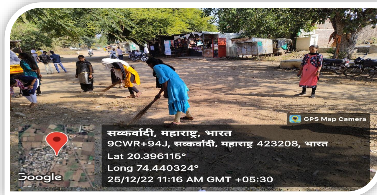
Cleaning of village campus by N.S.S. Students at Savkarwadi.