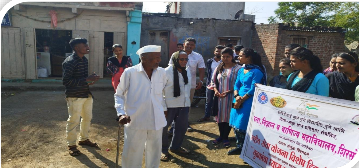
Volunteers during polling awareness at winter camp of National Service Scheme....