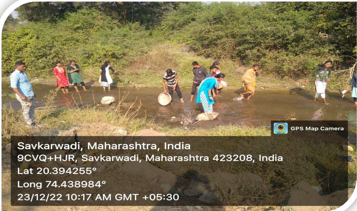
Cleaning of River by N.S.S. Students at Savkarwadi.