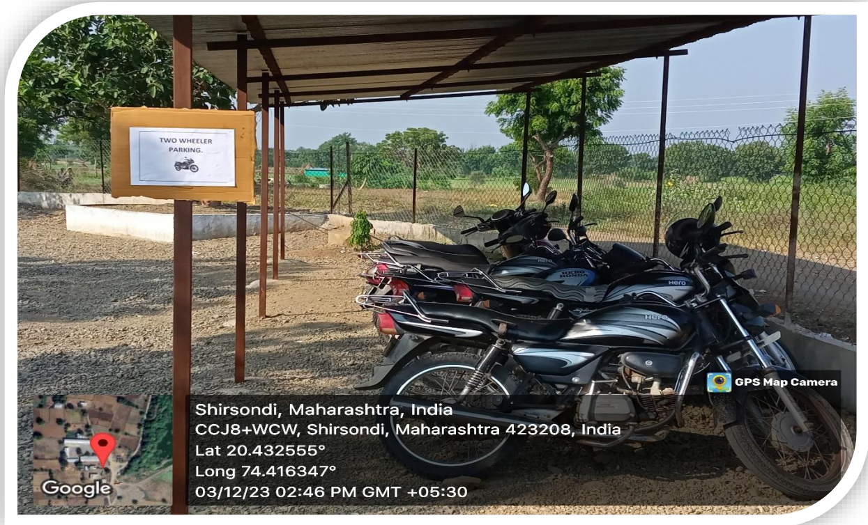
Two Wheelers Parking