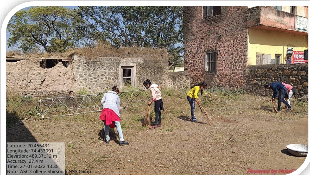
Cleaning of village campus by N.S.S. Students at Takali.