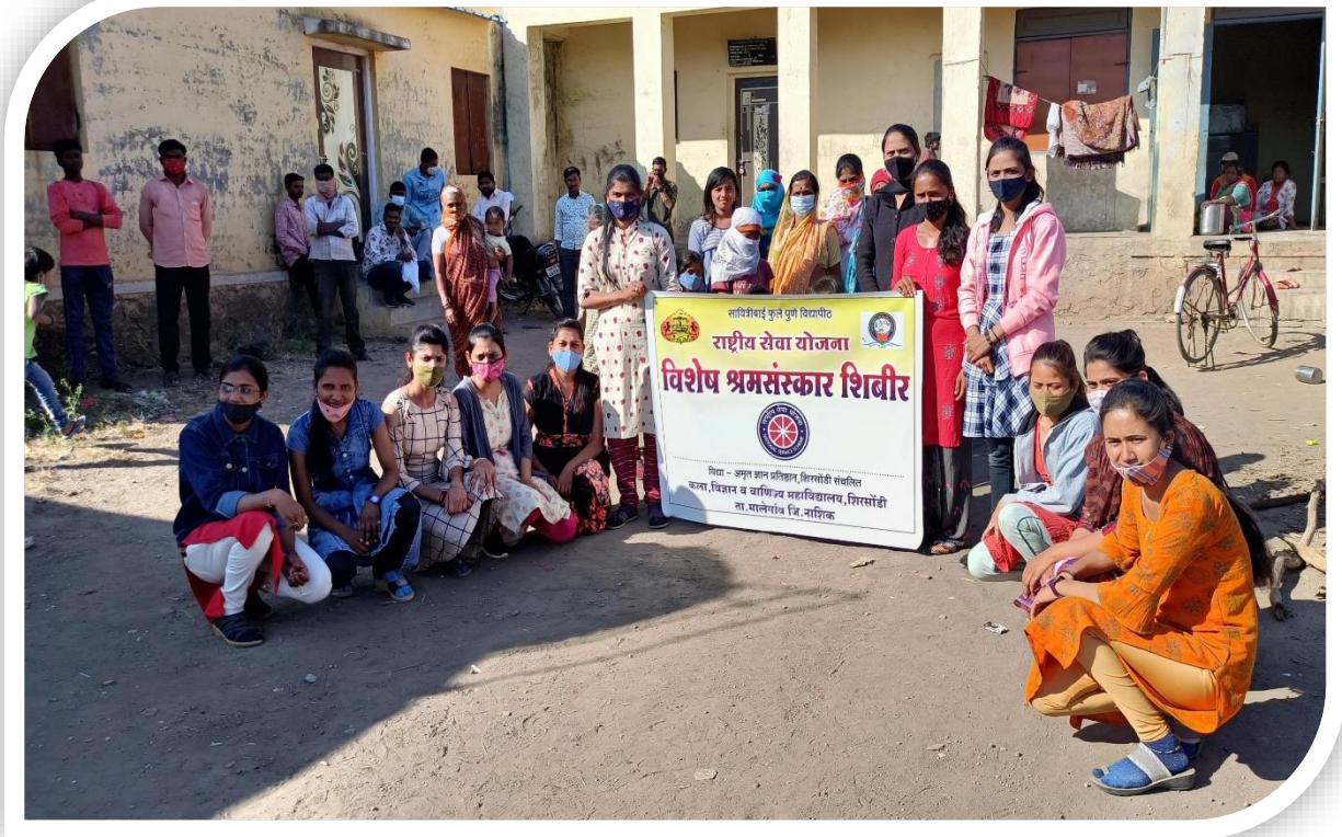
Winter camp of National Service Scheme was organized at Takali.