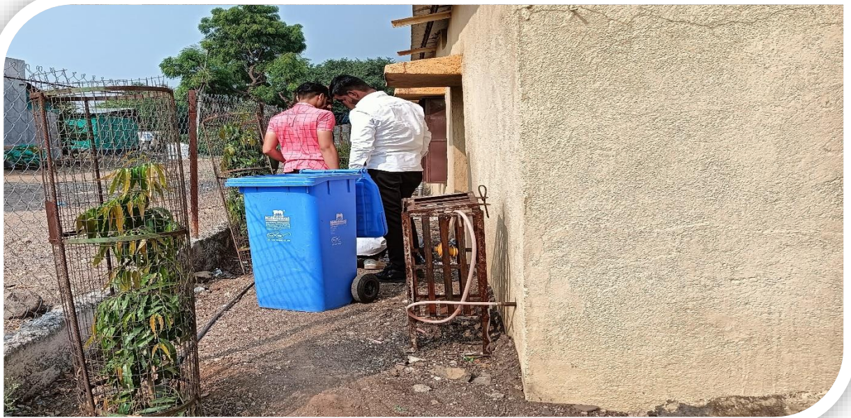
Plastic free campus at A.S.C. College, Shirsondi...