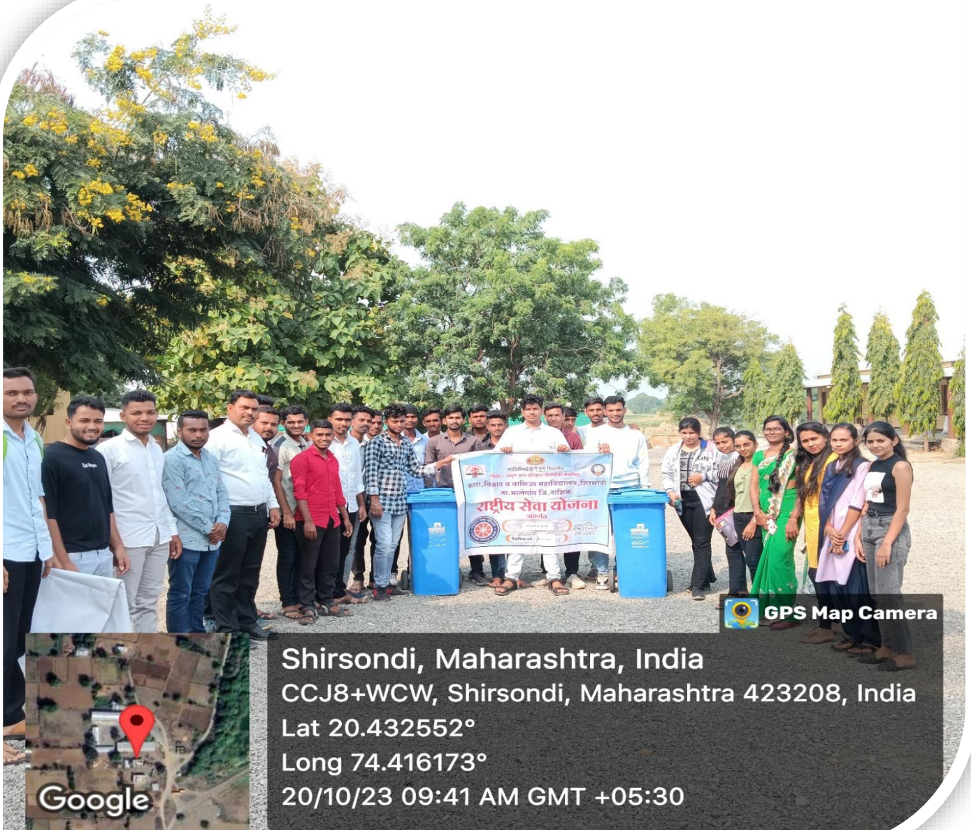
Volunteers of National Service Scheme while conducting cleanliness drive in college....