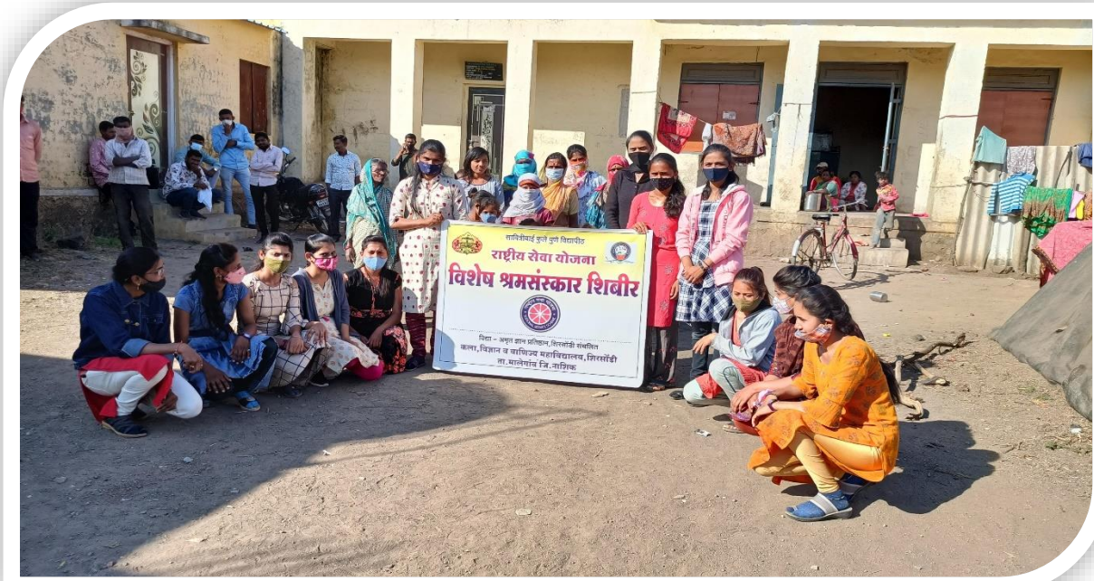
Social Awareness by N.S.S. Students at Takali.